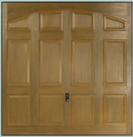
2046 Hazelbury - Close grain