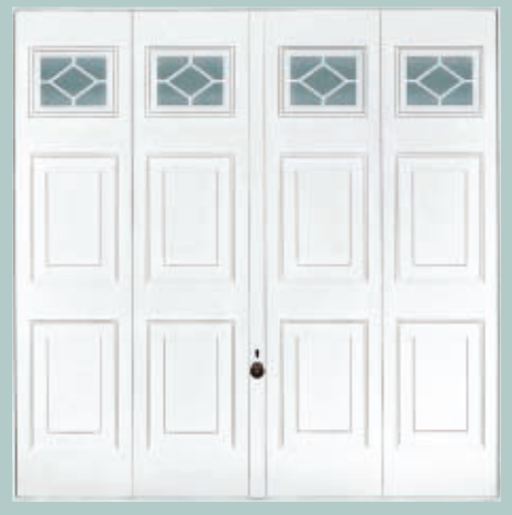
2304 Georgian with windows