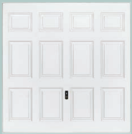
2041 Coniston *

Note, due to the manufacturing process "woodgrain effect" doors may vary slightly in colour.