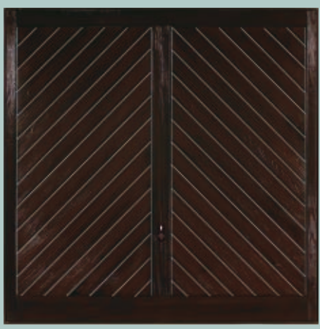
2035 Hartfield - Wide grain