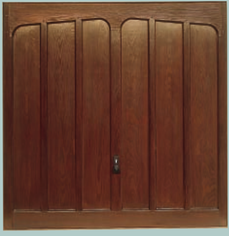
2034 Penshurst - Wide grain