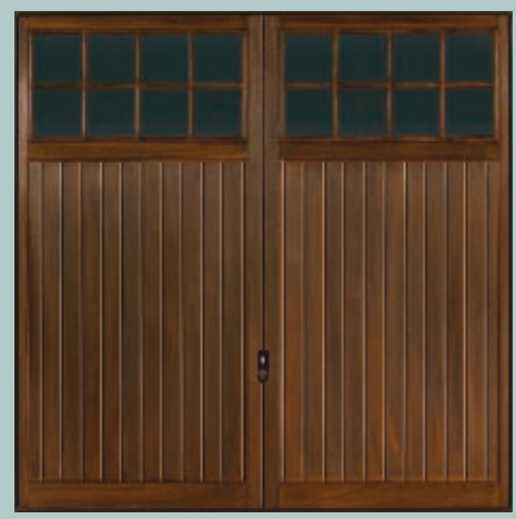
2040 Livingston - Close grain