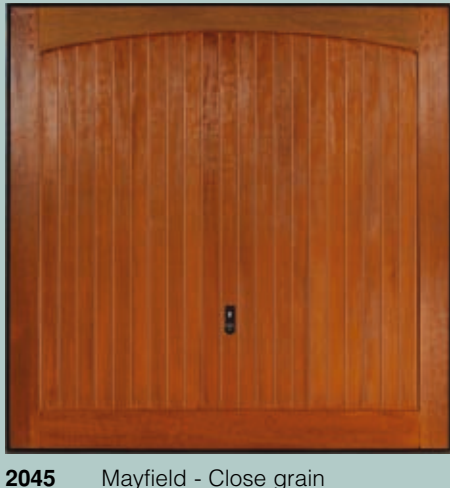
Mayfield - Close grain