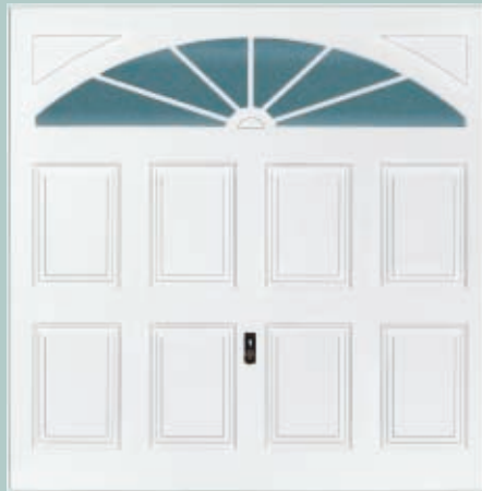
2044 Stamford *

Whilst Coniston and Stamford use White OFI (based on RAL 9016) on 7'0" and 7'6" wide doors, 8'0" and 9'0" doors use Brown OFI (based on RAL 8028) and therefore will not be as pictures shown.