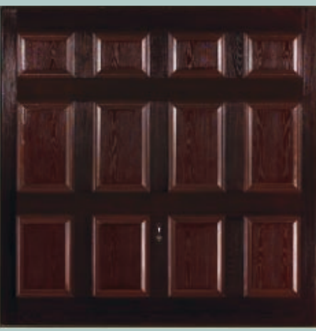
2042 Windermere - Wide grain